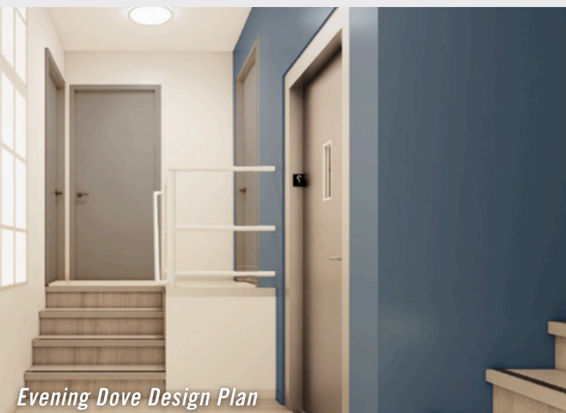
Evening Dove Design Plan

You voted, and CMG listened! We appreciate your participation in our poll - whether online, in person, or over the phone - and are happy to announce that the Evening Dove design plan won. We look forward to implementing your favorite design plan!